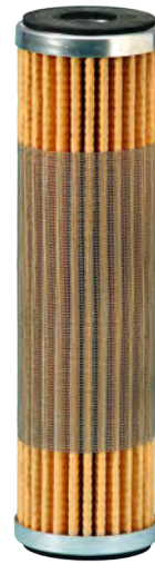
AC-21005 Filter Cartridge