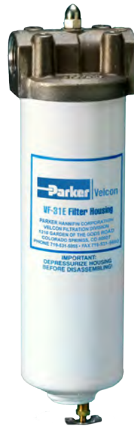
VF-31E Filter Housing

NOTE: For non-EI qualified applications. Housing does not meet EI1596 or EI1581 qualifications.