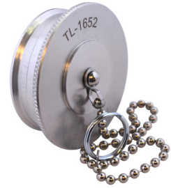
TL-1652 Dust Plug with Chain