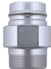
GTP-918-2 2" NPT GTP-918-4 2" BSP