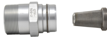
GTP-1534 24 x 110 mesh stainless steel Optional strainer for all 1½" actuators, except GTP-920-3S

For strainer and actuator assembly, order GTP-1510