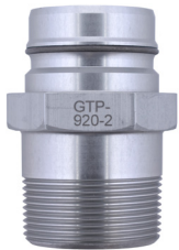
Male GTP-920-2 1½" NPT GTP-920-3 1½" BSP