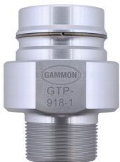
GTP-918-1 1½" NPT GTP-918-3 1½" BSP