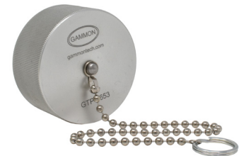
GTP-1653 Dust Cap with Chain