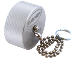
GTP-1428 Dust Cap with Chain