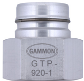
Female GTP-920-1 1½" NPT GTP-920-4 1½" BSP