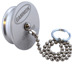
GTP-1768 Dust Plug with Chain