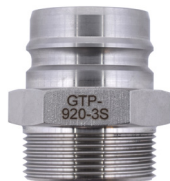
Male GTP-920-3S 1½" BSP Stainless Steel